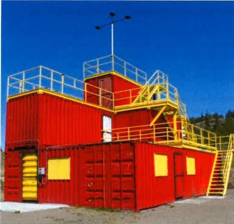
District of 100 Mile House Emergency Services Training Centre